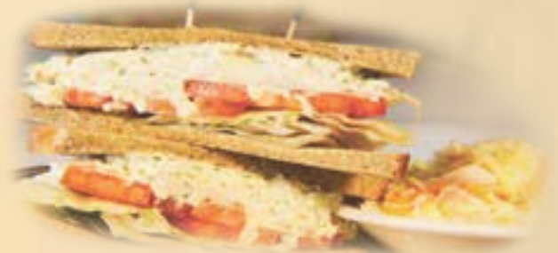
Jumbo Crab Cake 8.95 Served with potato chips and coleslaw